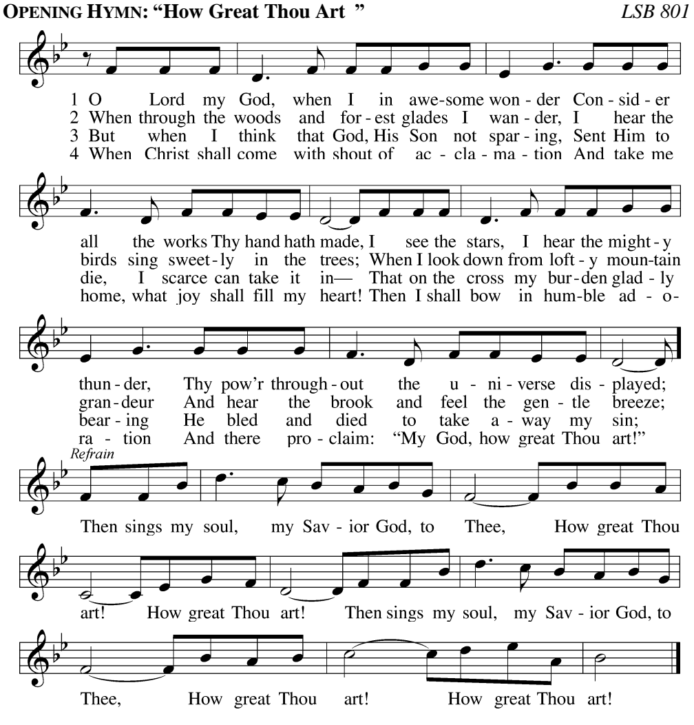
© 1949, 1953 The Stuart Hine Trust; admin. EMI CMG; admin. Hope Publishing Co.